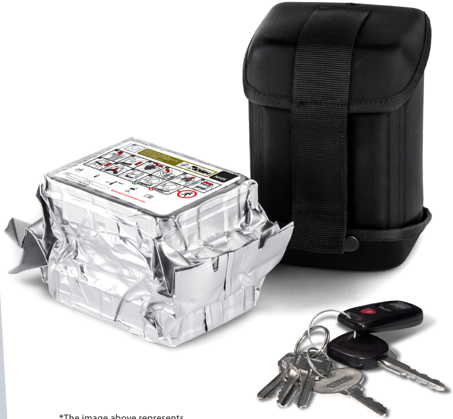
*The image above represents the NIOSH Standard Carrier