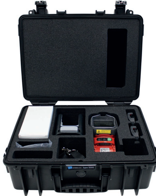
Black Hard Carry Case (camera contents not included)