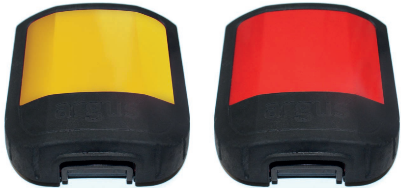
Rechargeable Battery Packs