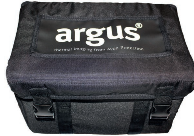
Soft Carry Case