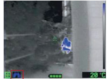
Missing Person Mode