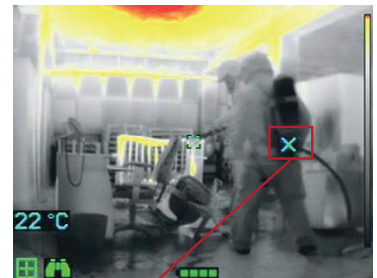
Cold Seeker Feature