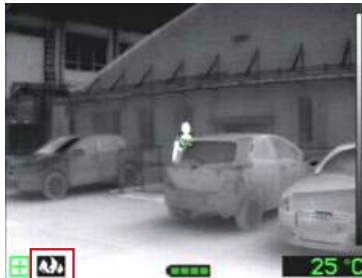
White Hot Mode