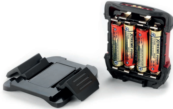
“AA” Battery Pack