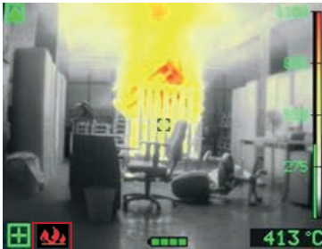
Fire Plus Mode